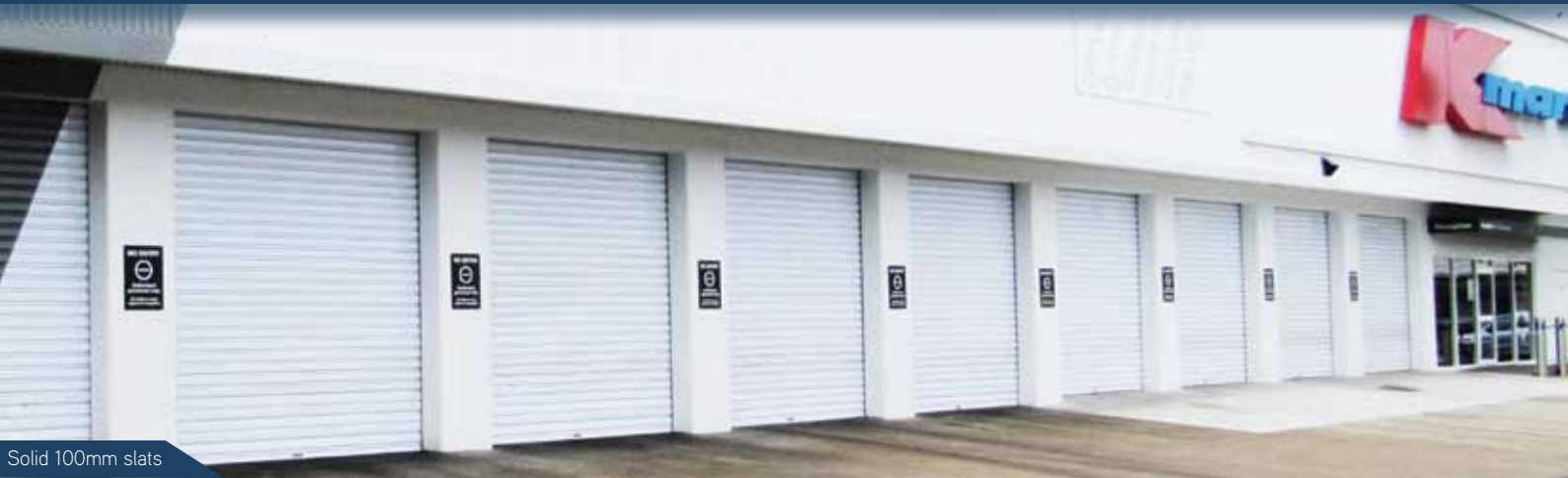
Solid 100mm slats