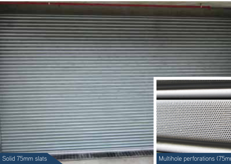
Solid 75mm slats